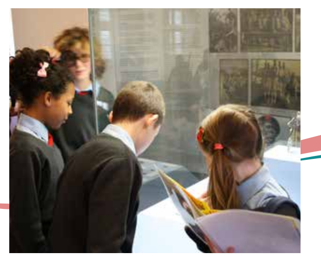
Donegal Museum Detectives searching for clues

Donegal County Museum is based in part of the old Letterkenny Workhouse, built in 1846. The Museum houses two exhibition galleries. A series of temporary exhibitions on a wide variety of topics, are held each year in the ground floor gallery. The first floor gallery explores the history of Donegal from the Stone Age to the Twentieth Century. Children and their families can find out more about the history of the county through the Donegal Museum Detectives backpack which is available to borrow free of charge during their visit to the Museum. Visitors can view the North West Film Archive and Islands Archives which contain over 100 hours of film material relating to Donegal and Derry. The Museum also organises a comprehensive programme of activities and events throughout the year both in the Museum and in venues throughout Donegal. Donegal County Museum has achieved both Full and Maintenance of Accreditation in the Museum Standards Programme of Ireland.