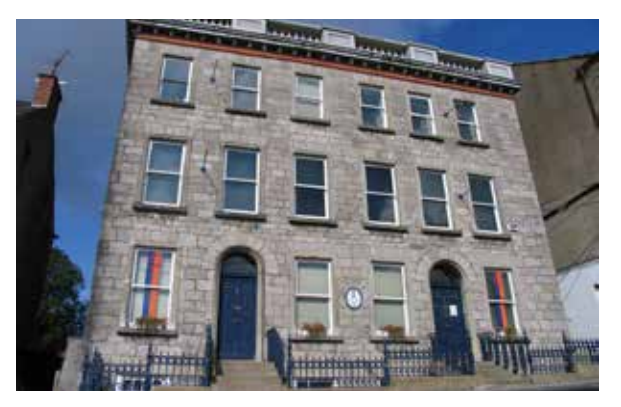
Monaghan County Museum