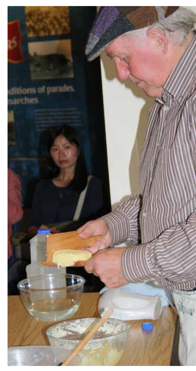
Making butter during Heritage Week in Donegal County Museum

The Local Authority Museums Network is now setting out its strategy for the next few years. The Strategy will build on its achievements to date and focus on ways in which it can continue to strengthen and develop its role, in a sustainable way, for the enjoyment and engagement of communities into the future. Highlights of this strategy include; examining ways to exploit the opportunities presented by technology to promote collections and reach out to new audiences; working collectively to play a distinct role in the Decade of Centenaries and 1916; exploring opportunities for collaboration through the new EU funding programme and continuing to strengthen and develop partnerships with its key stakeholder in order to deliver on its mission.