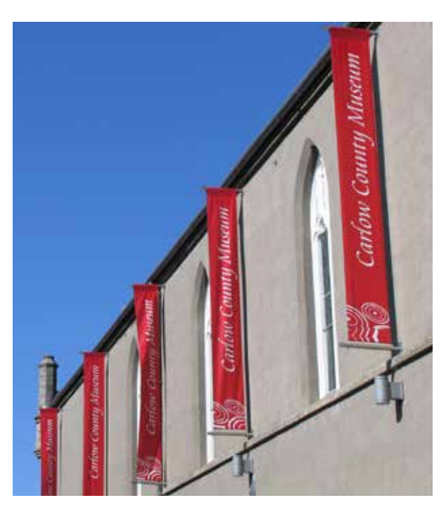
Carlow County Museum