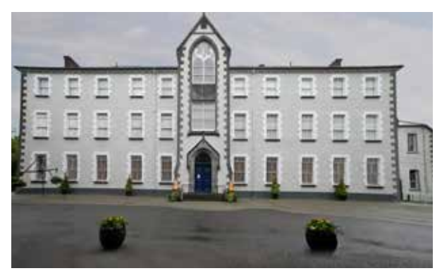
Cavan County Museum