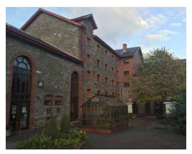
County Museum, Dundalk