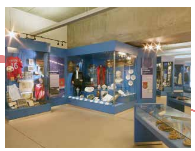
Exhibitions at Cork Public Museum