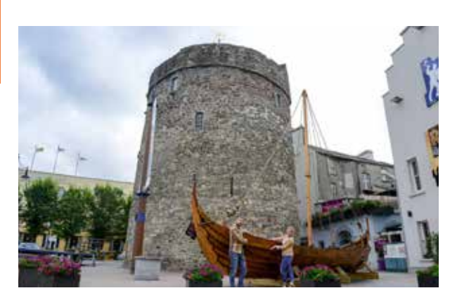
Reginald's Tower -Treasures of Viking Waterford

Reginald's Tower is Waterford's landmark monument and Ireland's oldest civic building. The tower houses a permanent exhibition on the treasures of Viking Waterford, including the 9th century sword and weapons from a Viking warrior's grave and the magnificent Waterford Kite Brooch, the finest example of gold and silver secular metalwork in Ireland. The tower is managed by the Office of Public Works.