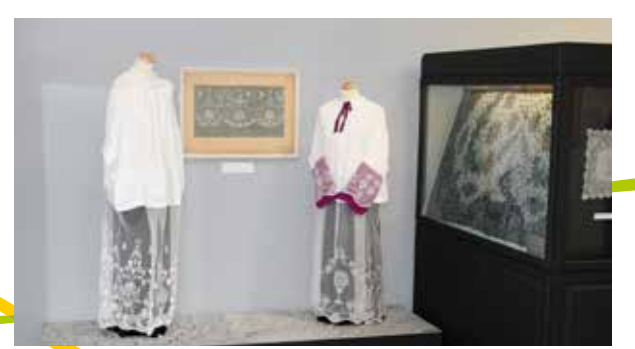
The Lace Exhibition, Limerick Museum