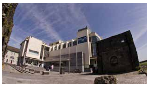
Galway City Museum