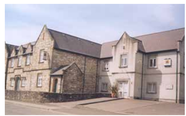
Donegal County Museum