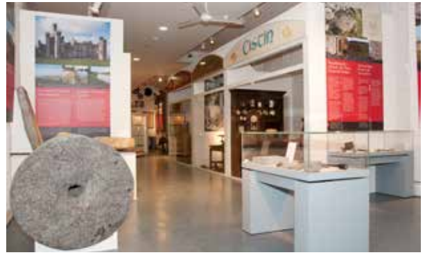
Ground floor exhibition, Carlow County Museum