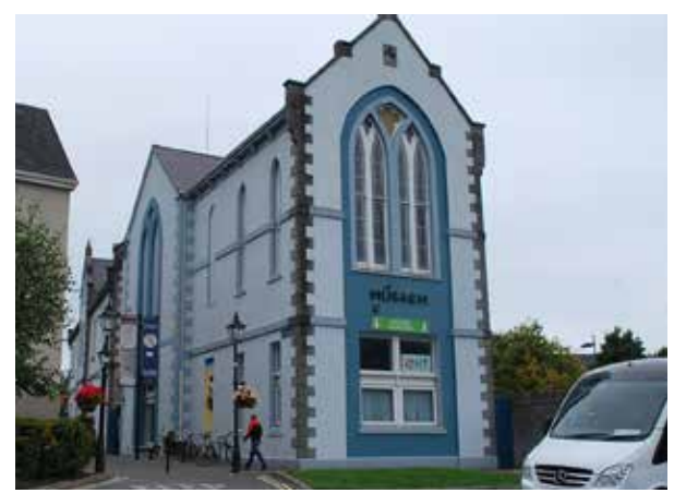
Clare County Museum