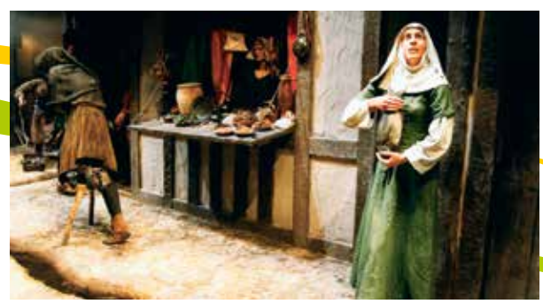
Medieval experience, Kerry County Museum