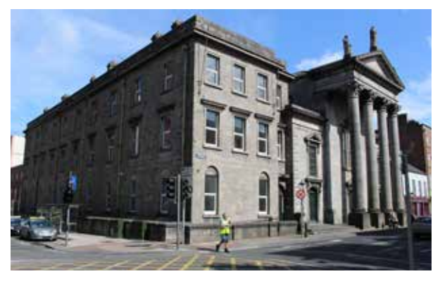
The Franciscan Friary, new home for Limerick Museum