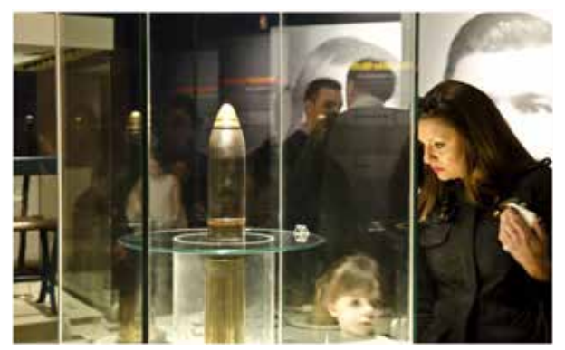
Exhibitions at Galway City Museum

The new Galway City Museum was officially opened in April 2007. The building was designed by the Office of Public Works and is a Galway City Council initiative to advance the cultural and heritage life of Galway City. The Museum is a spacious, modern building, situated in the heart of Galway city on the banks of the River Corrib and overlooking the famous Spanish Arch. It houses a variety of permanent and touring exhibitions representing Galway's rich archaeology, heritage and history.