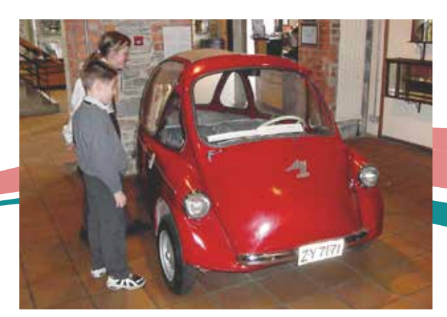
The most popular artefact in the County Museum Dundalk, the Heinkel motorcar, made in Dundalk at the end of the 1950s

The Museum boasts a collection of over 60,000 items ranging from perennial favourites such as the Heinkel motorcar and tobacco Indian to everyday items such as flint arrowheads and domestic materials. The Museum recalls a wide range of themes including the archaeology, history and geology of County Louth as well the area's industrial, social and cultural life covering a period of 5,000 years.